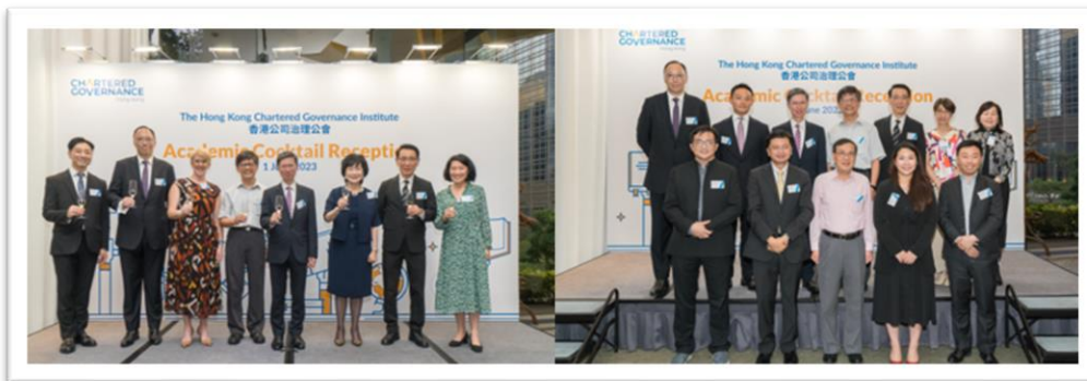
Academic Cocktail Reception 2023